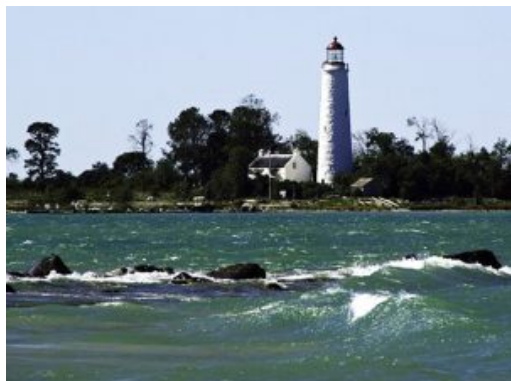
Chantry Island is home to over 10,000 pairs of mating birds, including cormorants, black-crowned night herons, great blue herons and egrets. Chantry Island is a Canadian Wildlife Service migratory bird sanctuary.

Chuck demonstrated a variety of paddle strokes and shared some basic tips; for me, don't use the death grip on the paddles; scoop from toes to hips and move your upper body, not your arms. Apparently, your arms shouldn't be tired out after kayaking. If they are, you are doing something wrong.